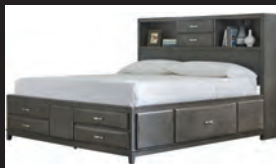
CAITLAND STORAGE BED $999 SALE