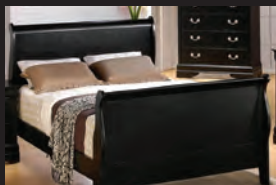
SLEIGH BED $199 SALE